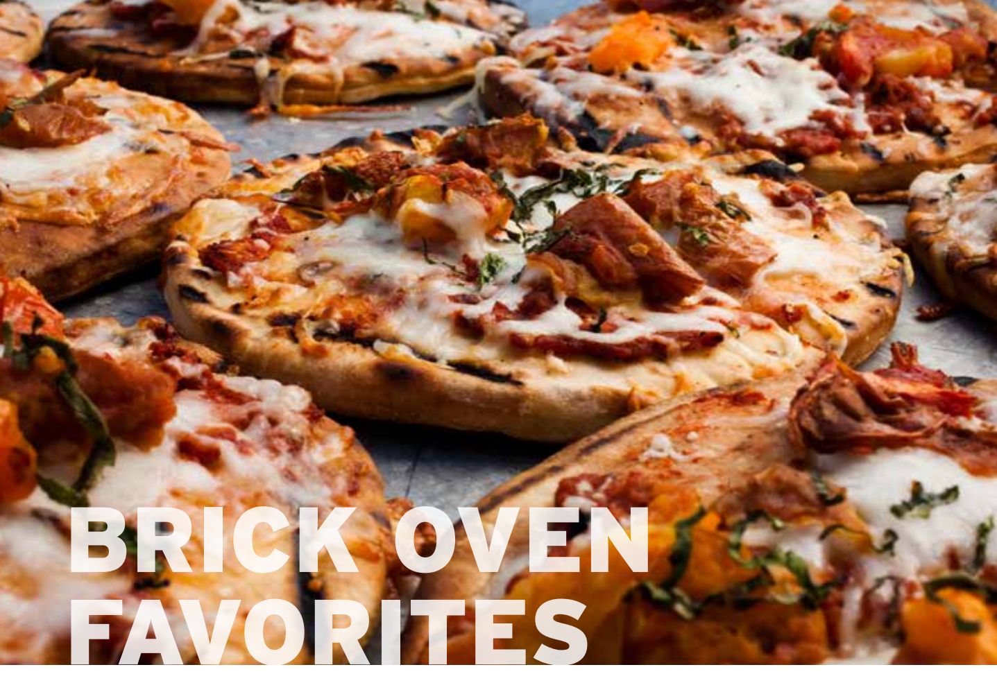
Our signature pizzas and Lavash are made to order and fired in our 800 degree Brick Oven. Please allow up to 30 minutes for delivery.