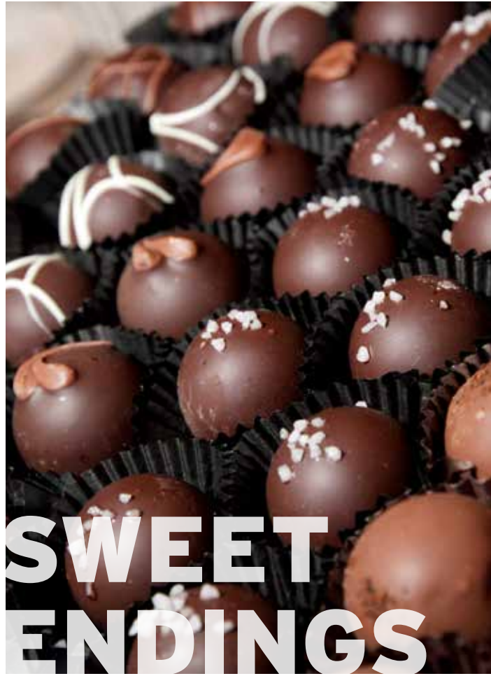
All Sweet Endings are created to serve a minimum of one Loge Box unless otherwise noted